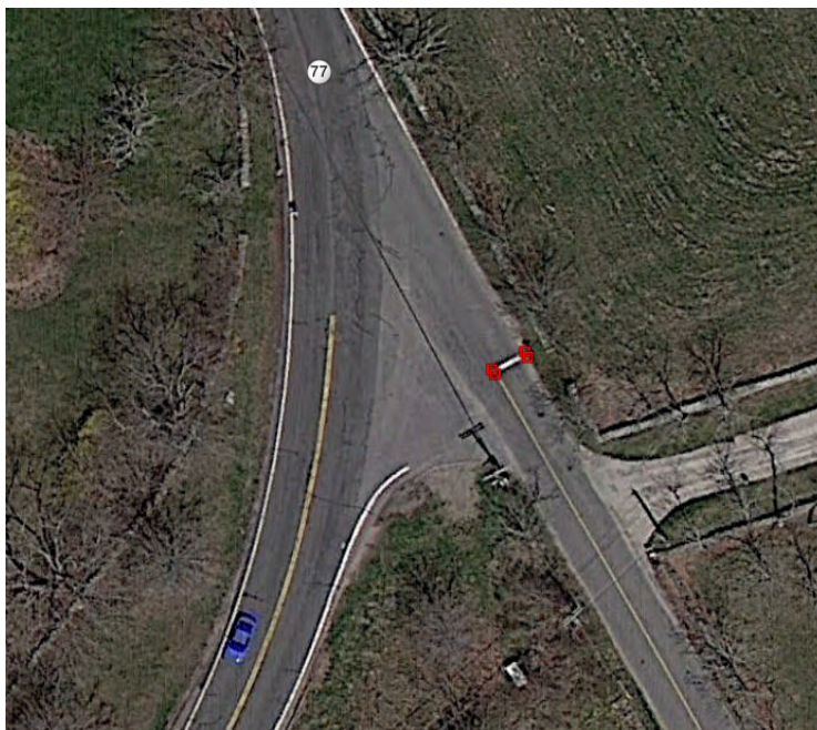
SKETCH (SUBSTITUTE STATION A)