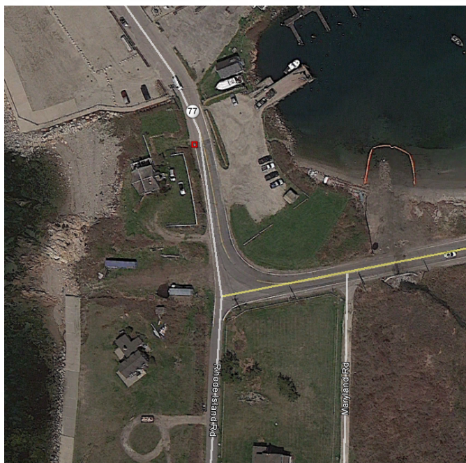
SKETCH (SUBSTITUTE STATION B)

DESCRIPTION OF SUBSTITUTE STATION B OR STATION IDENTIFIED DIRECT.