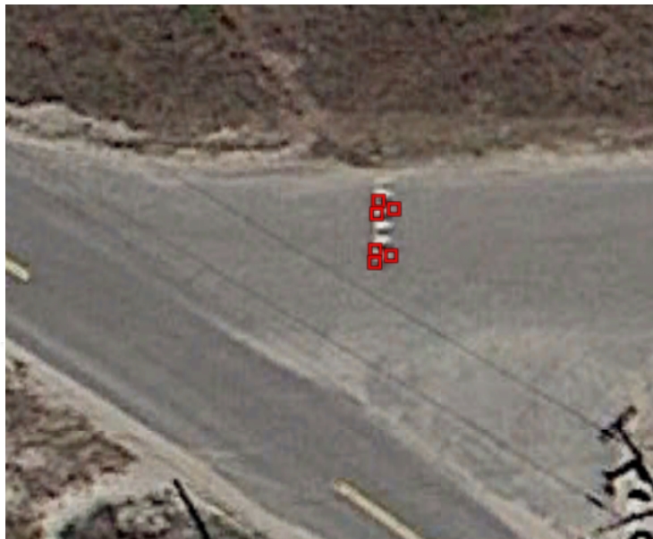
SKETCH (SUBSTITUTE STATION A)