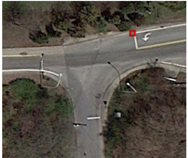
SKETCH (SUBSTITUTE STATION A)