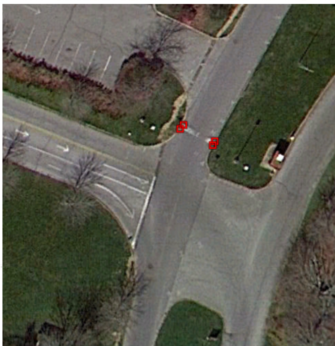
SKETCH (SUBSTITUTE STATION A)