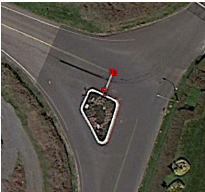
SKETCH (SUBSTITUTE STATION A)