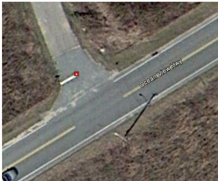
SKETCH (SUBSTITUTE STATION A)