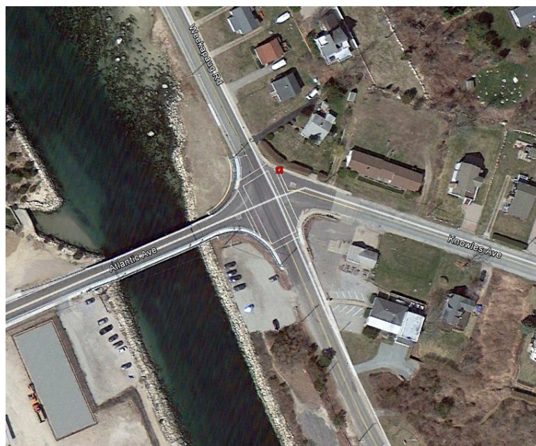
SKETCH (SUBSTITUTE STATION B)

DESCRIPTION OF SUBSTITUTE STATION B OR STATION IDENTIFIED DIRECT.