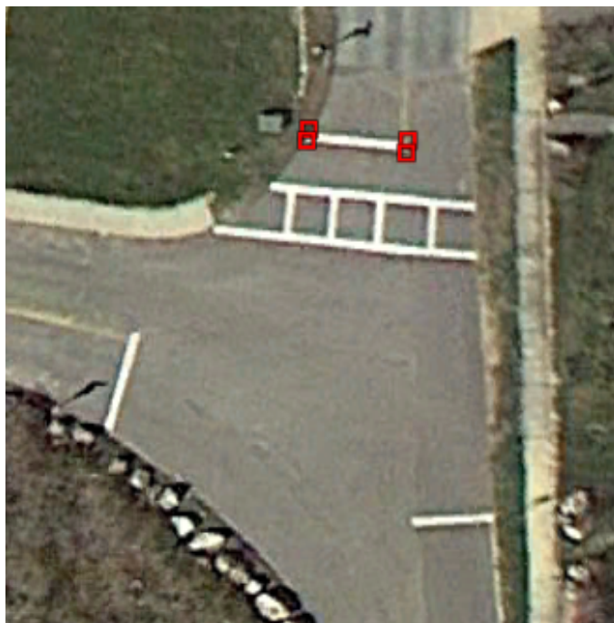
SKETCH (SUBSTITUTE STATION A)