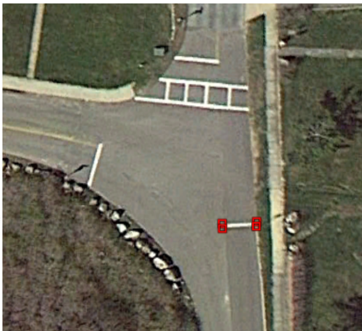
SKETCH (SUBSTITUTE STATION A)