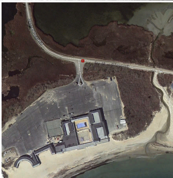
SKETCH (SUBSTITUTE STATION B)

DESCRIPTION OF SUBSTITUTE STATION B OR STATION IDENTIFIED DIRECT.