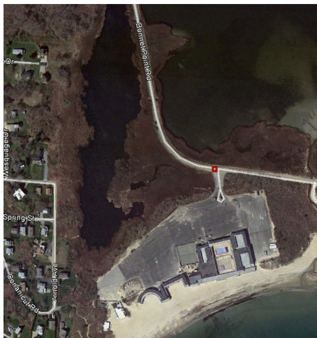
SKETCH (SUBSTITUTE STATION B)

DESCRIPTION OF SUBSTITUTE STATION B OR STATION IDENTIFIED DIRECT.