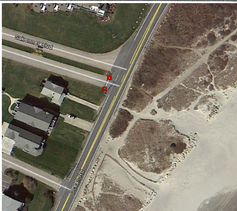
SKETCH (SUBSTITUTE STATION B)

DESCRIPTION OF SUBSTITUTE STATION B OR STATION IDENTIFIED DIRECT.