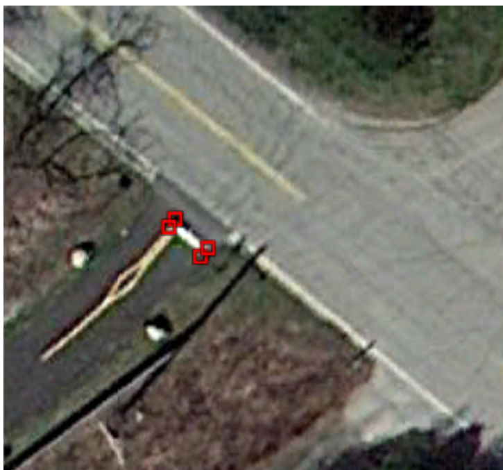
SKETCH (SUBSTITUTE STATION A)