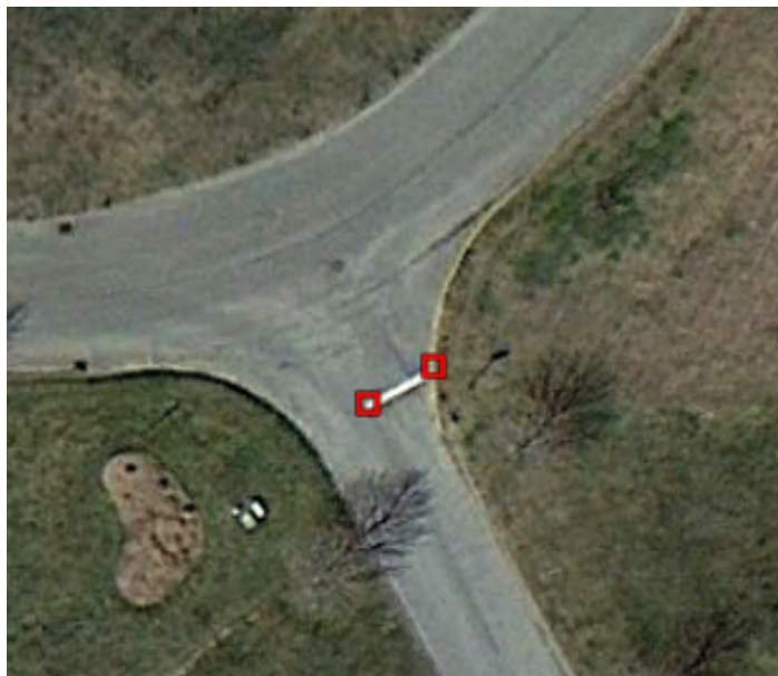
SKETCH (SUBSTITUTE STATION A)