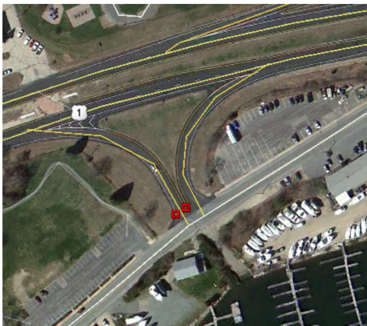
SKETCH (SUBSTITUTE STATION B)

DESCRIPTION OF SUBSTITUTE STATION B OR STATION IDENTIFIED DIRECT.