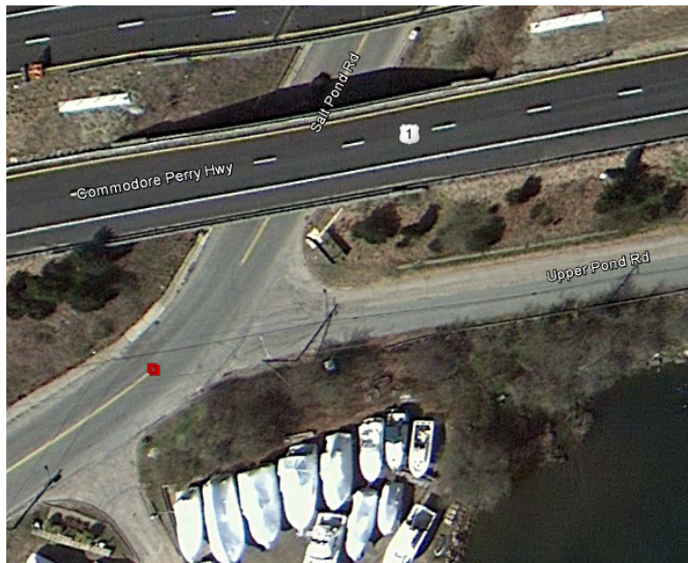
SKETCH (SUBSTITUTE STATION A)