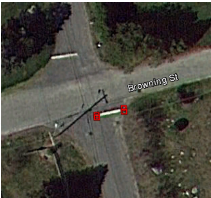
SKETCH (SUBSTITUTE STATION A)